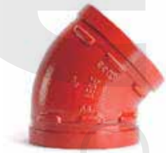
MODEL XGQT011L 45° LONG RADIUS ELBOW