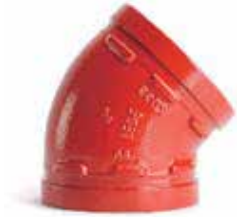
MODEL XGQT011 45° ELBOW