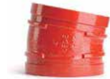
MODEL XGQT013 11-1/4° ELBOW