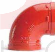
MODEL XGQT01L 90° LONG RADIUS ELBOW