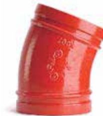
MODEL XGQT012 22-1/2° ELBOW