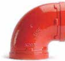
MODEL XGQT01 90° ELBOW