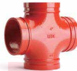
MODEL XGQT05 CROSS