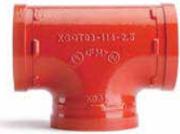
MODEL XGQT03L STANDARD TEE