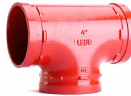
MODEL XGQT03 TEE