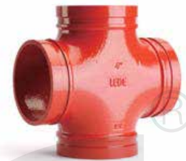
MODEL 5101 STANDARD CROSS